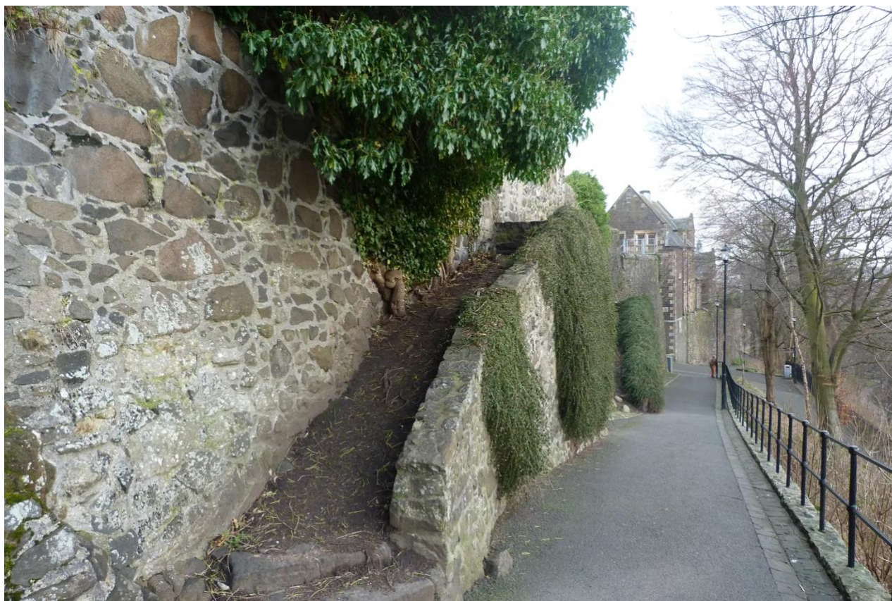
A section of Stirling's City Walls

www.slhf.org/event/stirling-walls-walk-talk