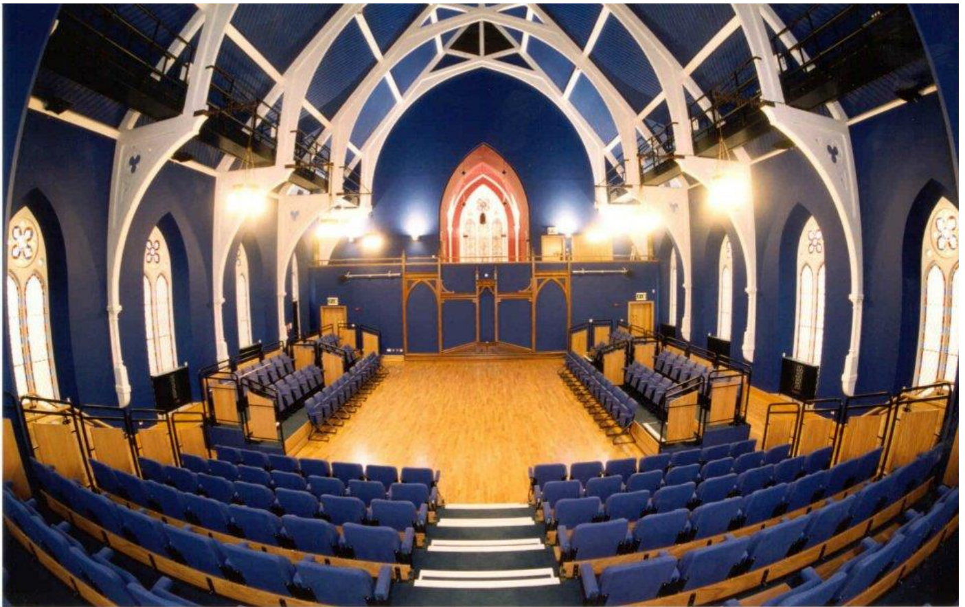
Wynd Centre Auditorium