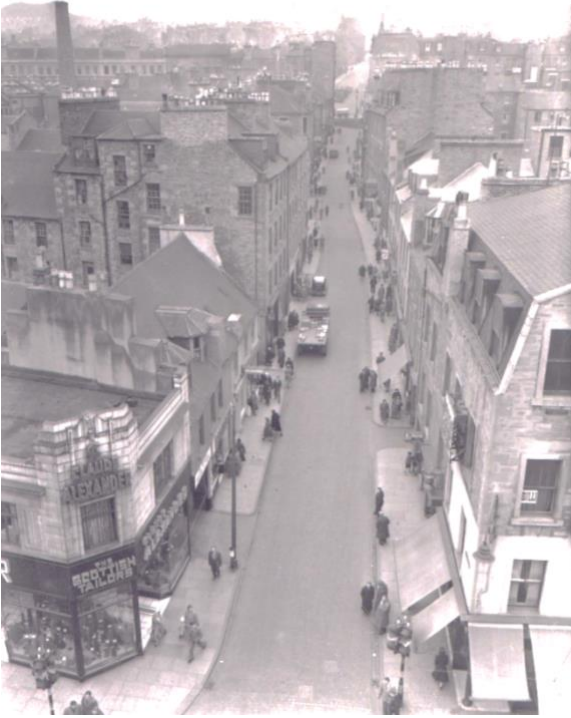
The Wellgate, Dundee, looking north to the Wellgate Steps