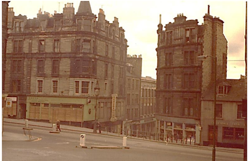
The Wellgate and Victoria Road awaiting demolition in the early 1970s