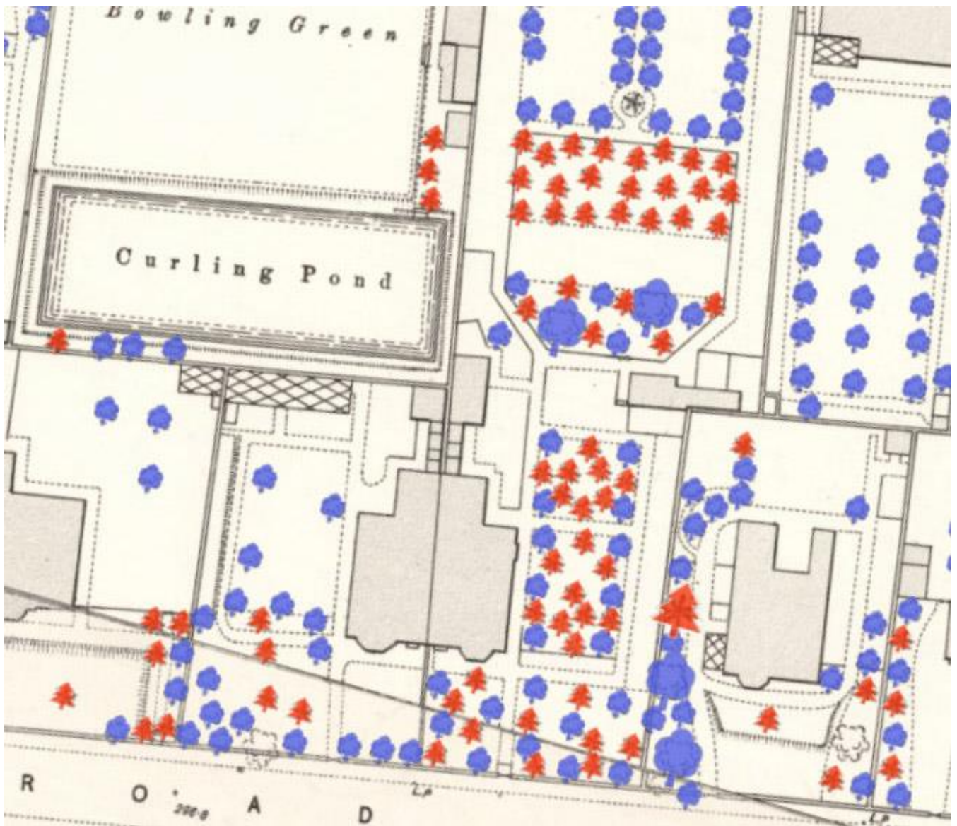
Detail from the Urban trees viewer, showing extracted tree symbols from OS 1:500 Town Plans of Edinburgh, 1890s

■ Bibliography of the Historical Cartography of Scotland This Bibliography , compiled by John Moore, was originally published over 40 years ago with just 238 entries, but John has continually maintained and expanded it since then. Now including over 770 references to articles relating specifically to maps and map-makers of Scotland, it has been made newly available online. It is possible to search by author, subject, and keyword, as well as browse the Bibliography through chronological, thematic and geographic sections. Informed descriptions and summaries accompany each citation. Further details: https://maps.nls.uk/guides/hist-cart-scot/