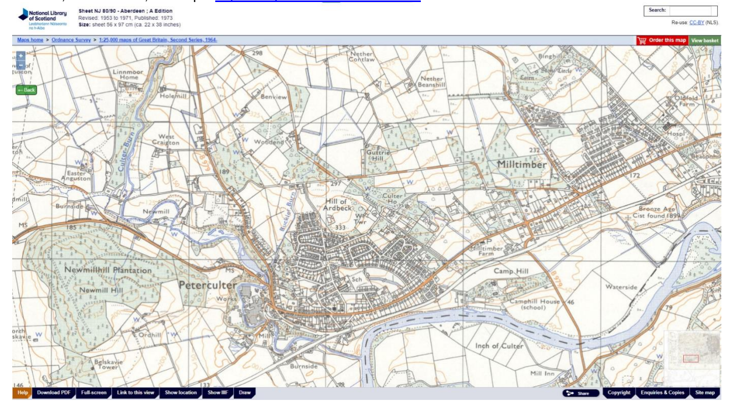
Detail from OS 1:25,000 Pathfinder Sheet NJ 80/90, published 1973

Large-scale National Grid maps: <a href="https://maps.nls.uk/os/national-grid/">https://maps.nls.uk/os/national-grid/</a> OS 1:25,000 and 1:63,360 maps: <a href="https://maps.nls.uk/additions/#156">https://maps.nls.uk/additions/#156</a>