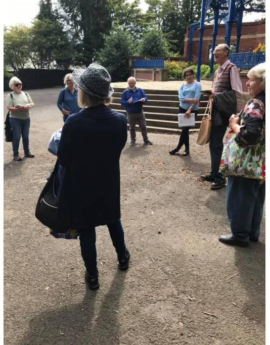
Members of Abertay Historical Society enjoy a tour of Balgay Park and Cemetery in summer 2021.

Since 1953, Abertay Historical Society has published at least one book every year on a topic relating to the history of Dundee, Angus, Perthshire or north Fife. Membership includes a free copy of the year's book, and they are also available for sale through our website - where many older titles are also available as free downloads - and