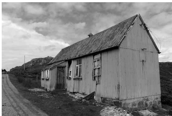
Fig.3: Achlyness (side) School, near Kinlochberrie, which closed in 1950, photographed in 2015. Author.

Other than 'normal' school holidays, which varied across the country, many other factors affected pupil attendance and are recorded in most log books. Many schools gave the children an extra holiday if they had given 'a good appearance' at the annual HMI inspection. Other local factors included: local weather – particularly snow in rural areas where children walked several miles to school; local religious ceremonies such as harvest thanksgivings, fast days, communion services, ordinations of church ministers, weddings and funerals; parish fairs and markets, many with long-lost names, such as Janet's Fair in Dingwall and the Timmer Market in Aberdeen at which pupils were required to tend animals and sell produce at stalls. Such entries can be particularly enlightening for local history studies – some being unique to individual schools