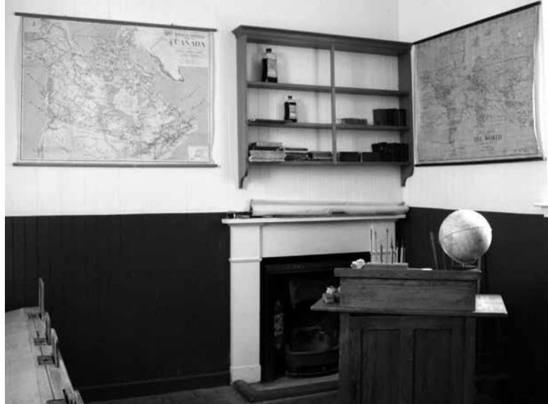
Fig.2: The classroom at St Kilda School, 2010.

Illness was also a common cause of low attendance and is assiduously recorded in almost all log books. Until 1904, School Boards could close their schools during local outbreaks of life-threatening diseases, especially scarlet fever, diphtheria and measles. After 1904, schools had to obtain a certificate of closure from the County Medical Officer of Health (MOH). Authorised closures were always recorded in the log book because HMI could account for these in calculating the average attendance component of the school's State funding. For the same reason, most head teachers also recorded other illnesses, such as