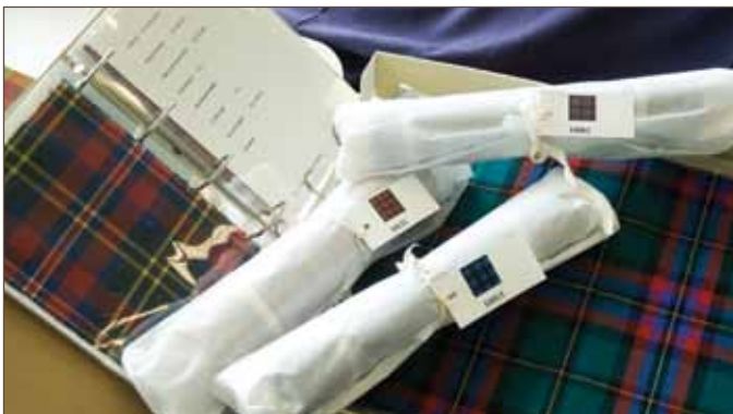
The Tartan Register woven sample archive.