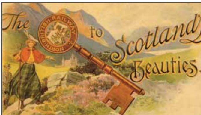
BR/LIB(S)/3/2/13: Illustration from a travel brochure, early 20th century.

A design becomes a tartan when it is woven, and we ask all registrants to submit a woven sample of their tartan as soon as one is available. Woven samples will be used to improve the graphic of your tartan displayed on the Register and will then be permanently preserved alongside the Scottish national archives in the National Records of Scotland.