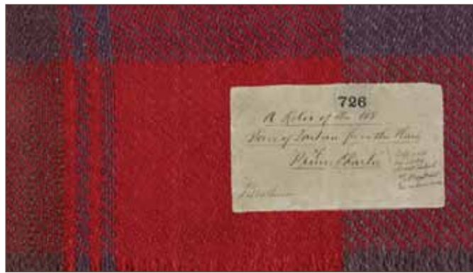
RH19/36: A piece of Bonnie Prince Charlie's plaid.