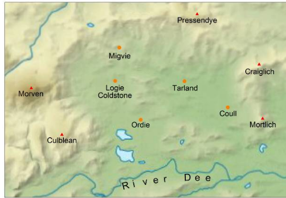
The Howe of Cromar