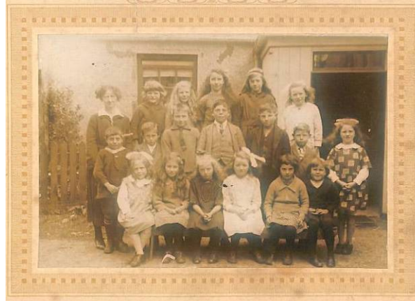
Pupils at Kinord School 1925

The Cromar History Group holds a large collection of documents, pictures and artefacts donated to us over the years. Over the past few years, we have been recording them on a database. They mainly relate to the Howe of Cromar with its main communities of Tarland, Logie Coldstone, Coull, Ordie and Migvie. We do not hold archive items for other communities on Deeside or Donside.