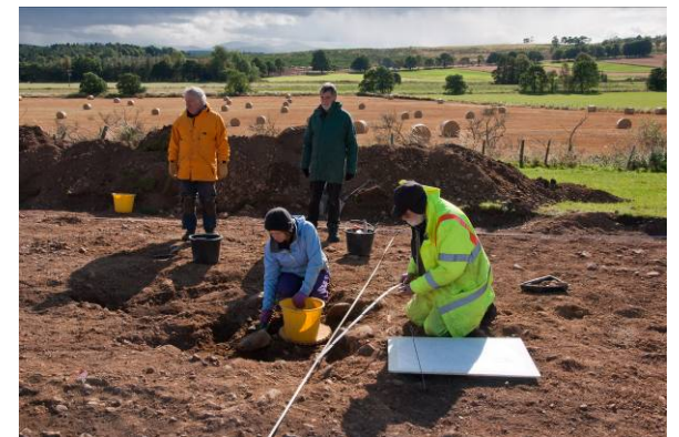
Excavations at Waulkmill, Tarland in 2012

Cromar History Group members have been actively involved with the excavations in recent years in Cromar including Tomnaverie, Waulkmill, Hillhead, and Old Kinord. Several of our members have been sufficiently inspired to seek academic qualifications in archaeology at Aberdeen University.