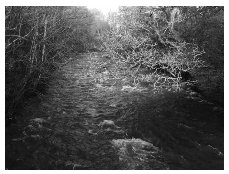
Fig.4: Allan Water in spate following the thaw in 2010. Similar spates in March 1674 caused new disruption.

freezes only after prolonged spells of very cold weather. December 2009 and January 2010 were the coldest two months in Scotland since records began in 1912, with daytime temperatures down to minus 12 C; the Forth froze at Stirling Bridge on 10 January 2010.<sup>75</sup>