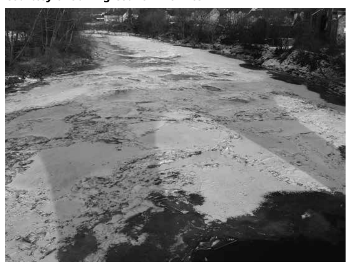
Fig.3: The Forth frozen above Stirling Bridge, January 2010 (as in March 1674).