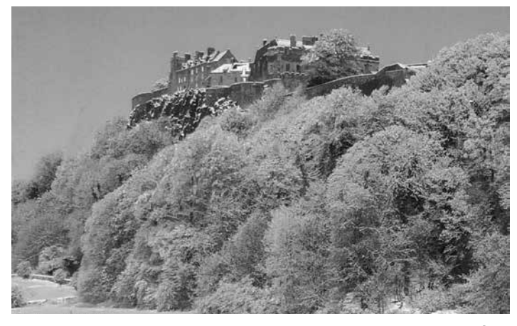
Fig.1: Stirling Castle, December 2009. It takes a good breakfast and warm clothing to make this scene beautiful.

On 18 January congregations were sparse, collections were deferred or sessions abandoned on account of the weather at Humbie, Innerwick, Swinton and Castleton.<sup>45</sup> At Jedburgh some people were now in extreme poverty.<sup>46</sup> Meetings of the Presbyteries of Meigle (20 January) and Ellon (21 January, deferred from the previous week) were sparsely attended.<sup>47</sup> On 21 January, Robert Turnbull, writing from Stirling, hoped that better weather 'after so much foul' would soon curtail expensive delays to a voyage.<sup>48</sup> On 22 January, Perth announced a special collection for the poor.<sup>49</sup> The session of Duns excused an accused woman from attending because of the storm on 24 January and for four weeks afterwards. At St Vigeans on 25 January the session allowed an extra dollar for the poor