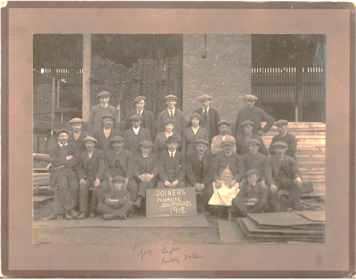
Panmure Shipyard Joiners, Dundee, featuring two female workers, 1918